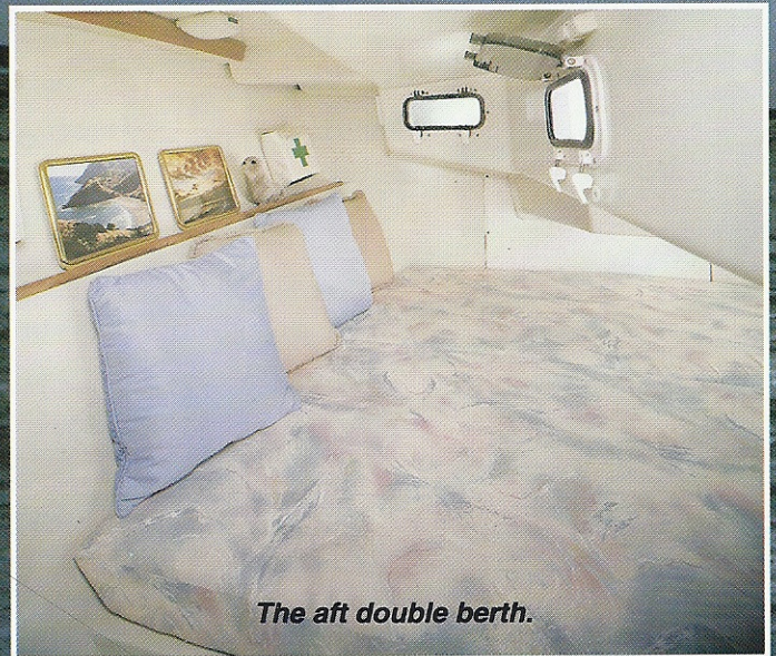
The aft double berth.

The deck is highlighted by a "big boat" cockpit with Catalina's hallmark full length cockpit seats with ergonomically contoured seat backs necessary for long term comfort aboard.