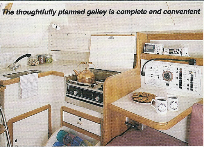
The thoughtfully planned galley is complete and convenient