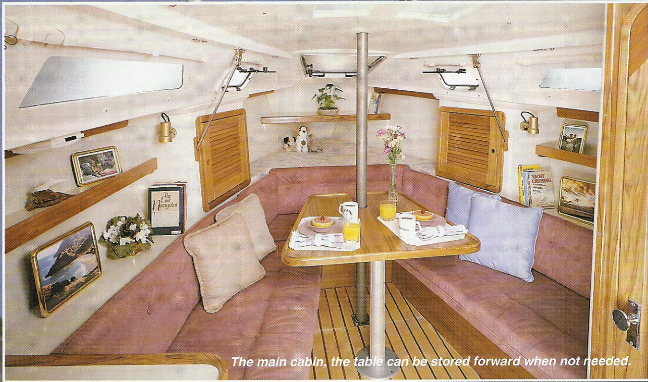
The main cabin, the table can be stored forward when not needed.